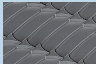
Off-axis & truncated lens array