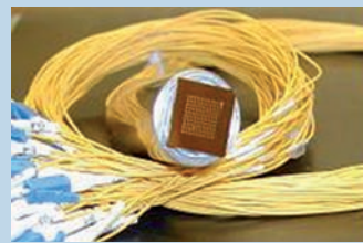
N x N fiber collimator array

It is our policy to constantly improve the design and specifications. Accordingly, the details represented herein cannot be regarded as final and binding.